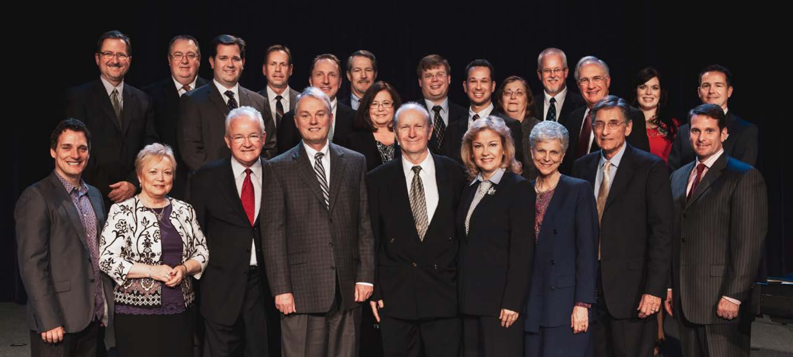
At the signing of the CFNI-DBU Articulation Agreement, 2011.