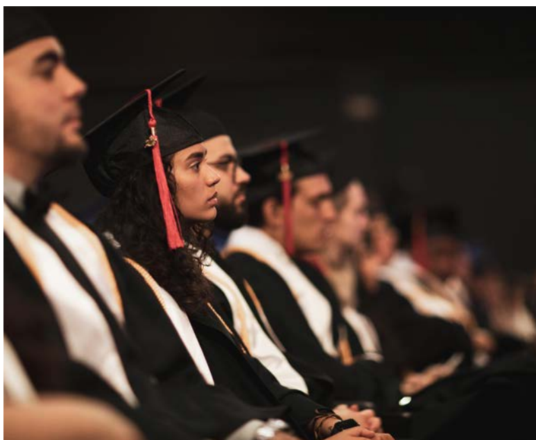
Graduates receiving the empowering word given by the commencement guest speaker.