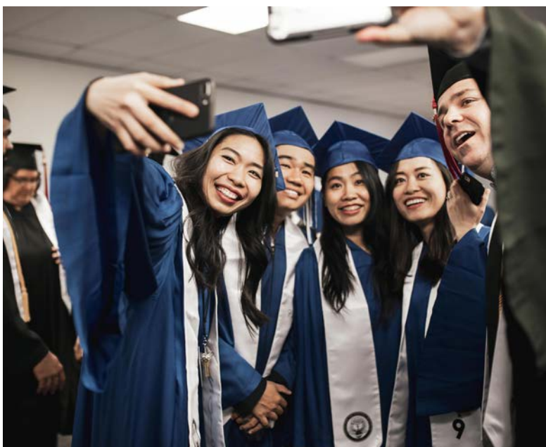
Graduates excitedly snapping last photos as they prepare to march into their ceremony.