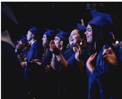
The class of Spring 2019 worshipping together as they did each morning in chapel as students.