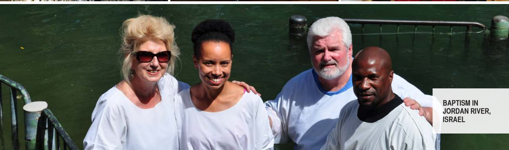
BAPTISM IN JORDAN RIVER, ISRAEL