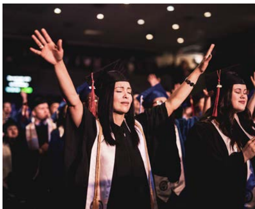
Worship is integral to the very heart of CFNI.