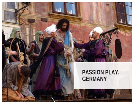
PASSION PLAY, GERMANY